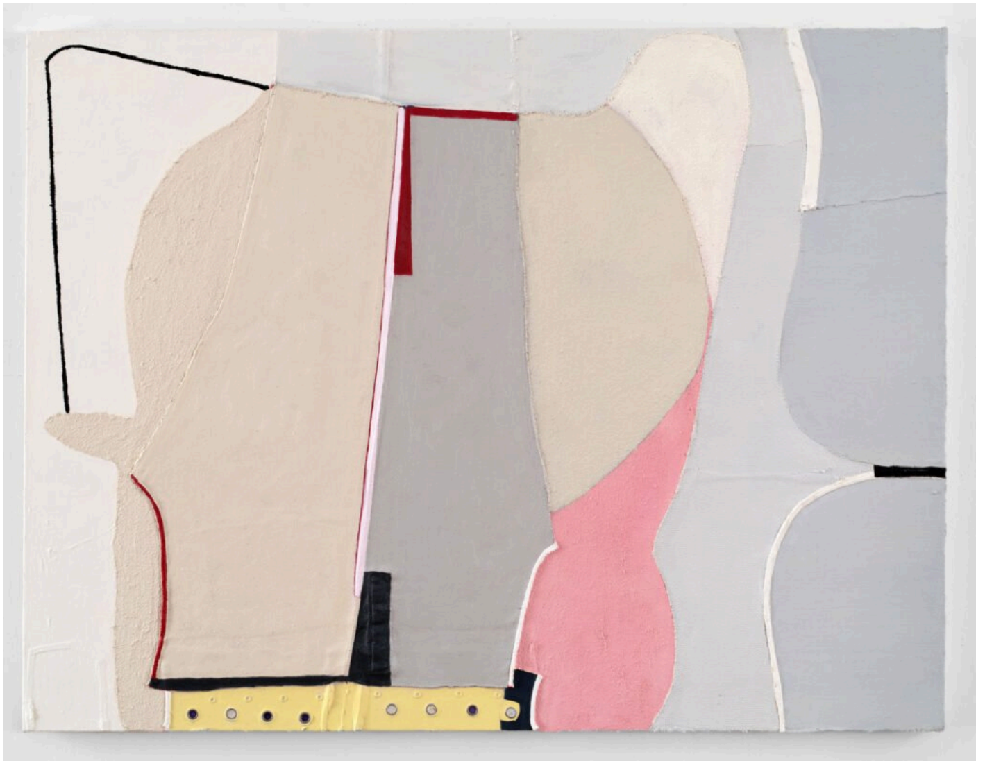
Medrie MacPhee, Left-Handed Dream, 2023, Mixed media and oil on canvas, 45 x 55 inches

All (/shows) A Matter of Time (/a-matter-of-time)